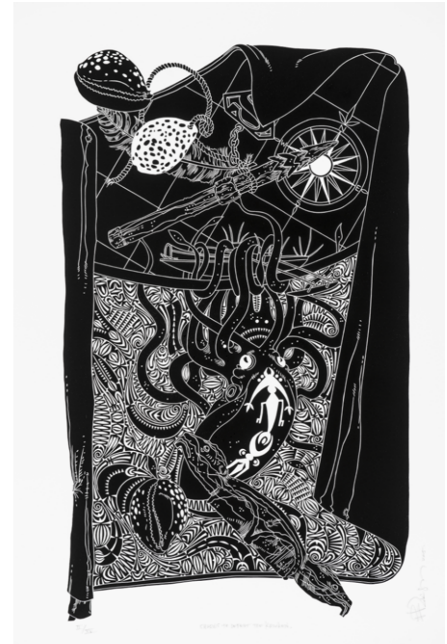
Charms to defeat the kracken, 2015, Linocut, 99 x 59 cm