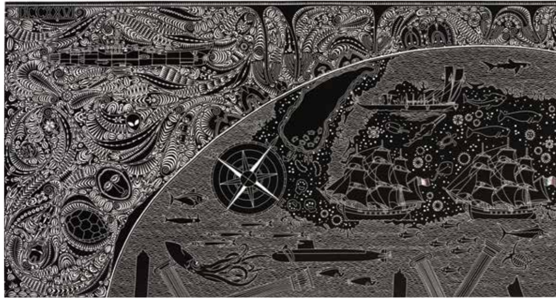
Uncharted: Astrolabe and Zelee in Kulkalgal country , 2020, Linocut printed in black ink from one block, 100 x 188cm