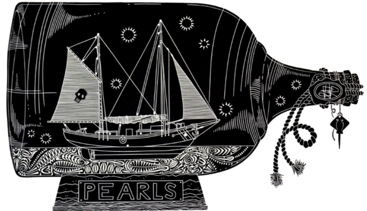
Old man of the sea, 2017, Linocut, 57 x 98.5 cm