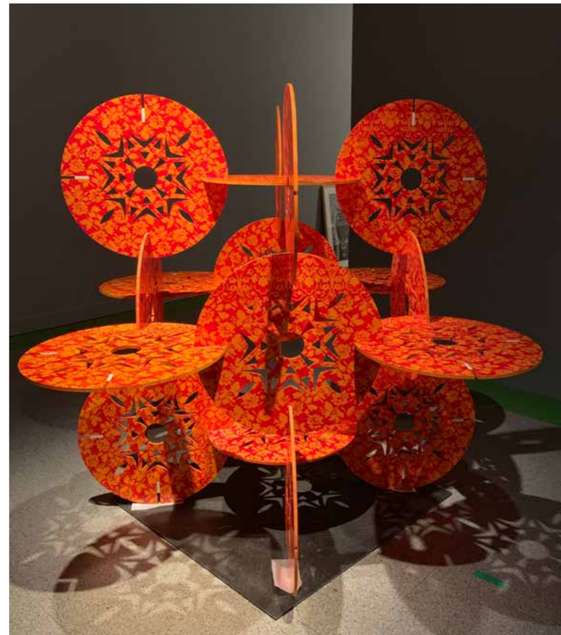
Thithuyil: Discerning some order in their apparent kaos, 2017 Mixed media, 170 x 170 x 170 cm

My creations are seemingly incongruous concoctions where many motifs and characters are co-opted into the spirit world of the Islander imagination, which are then intertwined with historical narrative, personal history and humour. These forms often take emblematic shape – masks and masked figures, referencing performative and ceremonial Islander traditions; dinghies and canoes, symbolic of travel and exchange; and the floral bloom, symbolic of fertility, abundance, harvest and regeneration.