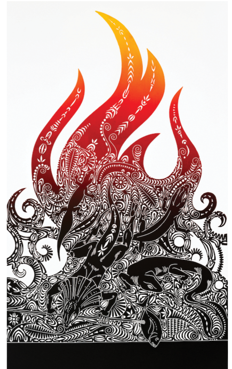
Walek, the bringer of fire, 2018, Linocut, 97 x 60 cm