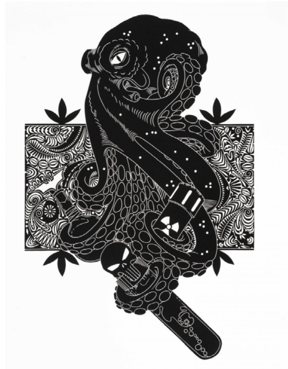
Proteus the oceanic alchemist , 2018, Linocut, 93 x 62 cm