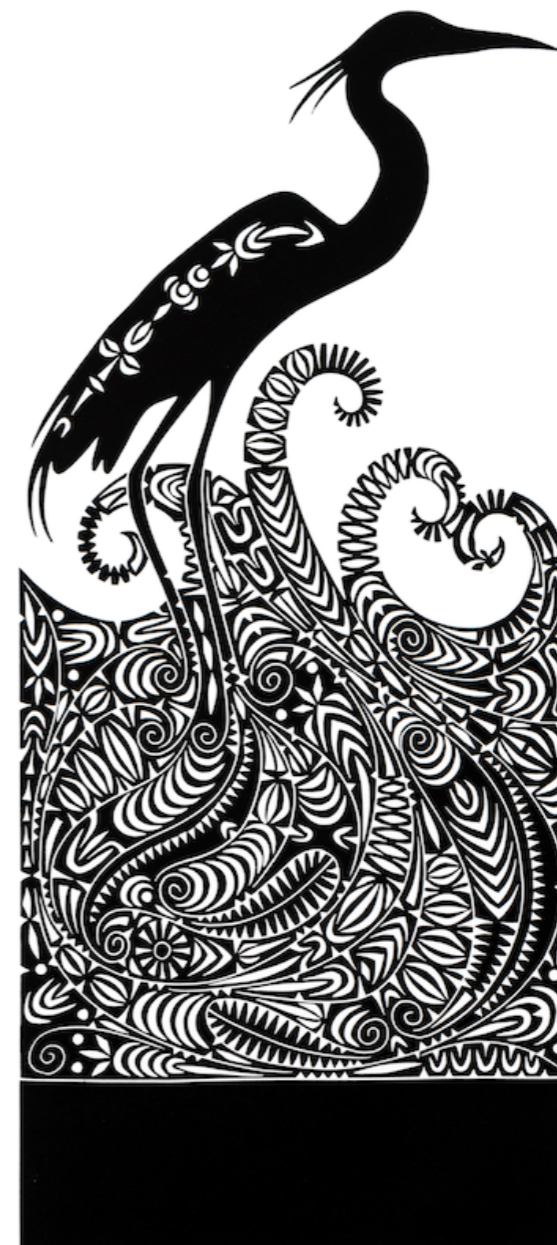
Karbai: Egretta Sacra, 2018, Linocut, 70 x 30 cm