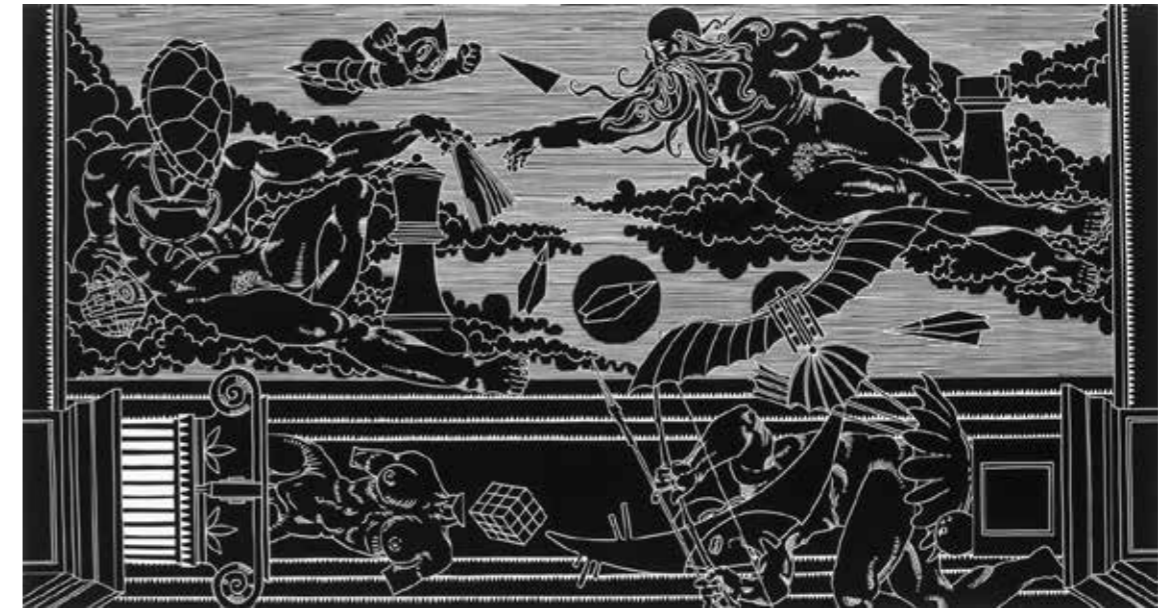
Up in the heavens , 2015, Linocut, 60 x 114cm