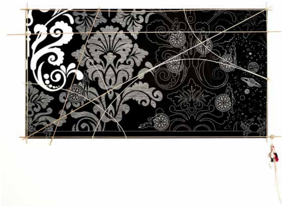
Usal: The seven sisters that play amongst the stars , 2016, Linocut on paper on board, mixed media, 100 x 194 cm