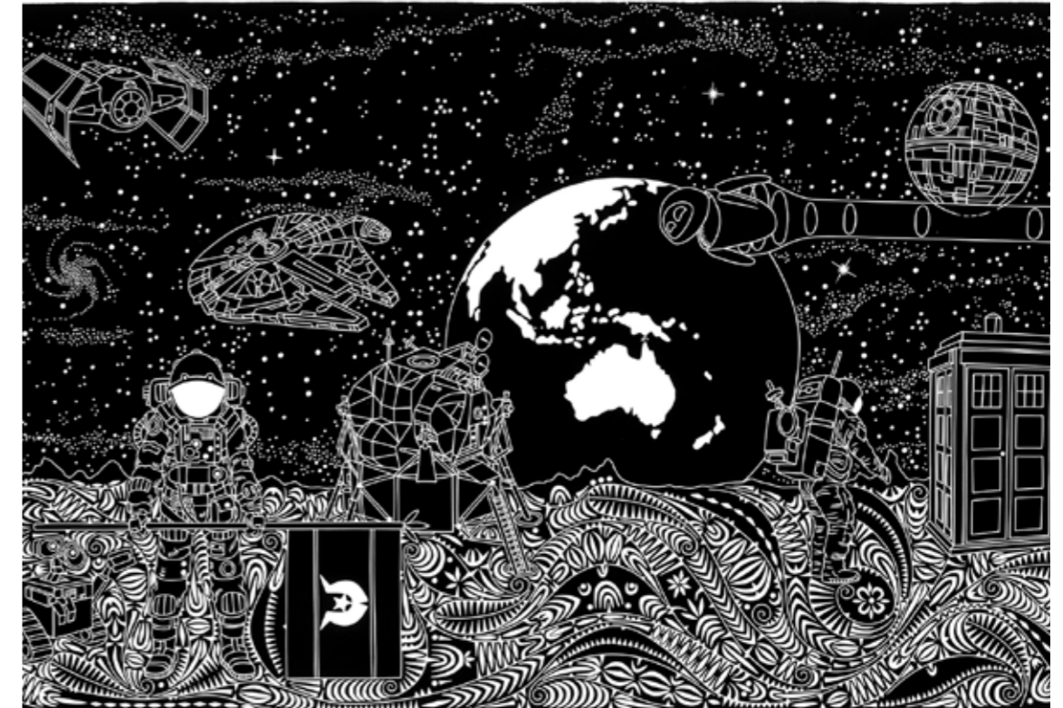
Mapping the cosmos from kisai, 2018, Linocut printed in black ink from one block 80 x 128 cm