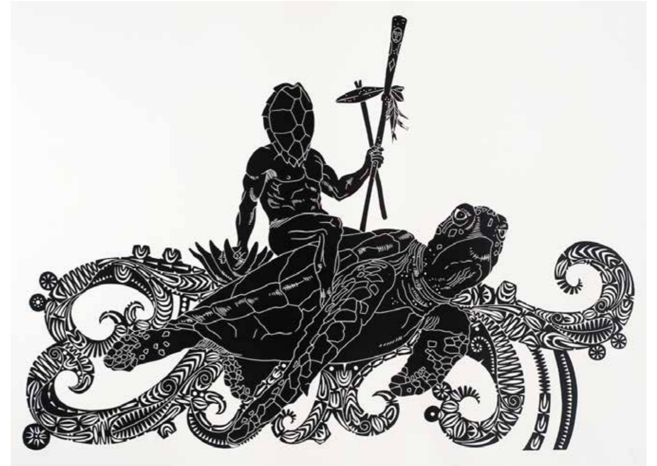
Reef guardian 1, 2017, Linocut printed in black ink from one block, 70.5 x 100 cm

2021 Cronulla Park and Lookout Artwork, Cronulla NSW 2021 Strand Ephemera 2021, Townsville QLD 2020 Sheffield Main Street Revitalisation Project – Public Art Component, Sheffield TAS 2020 Oakleigh Park Fountain Upgrade – Public Art Component, Burnie TAS 2020 The Grange Community Centre, Wyndham VIC 2020 Nunawading Community Hub Project, Nunawading VIC