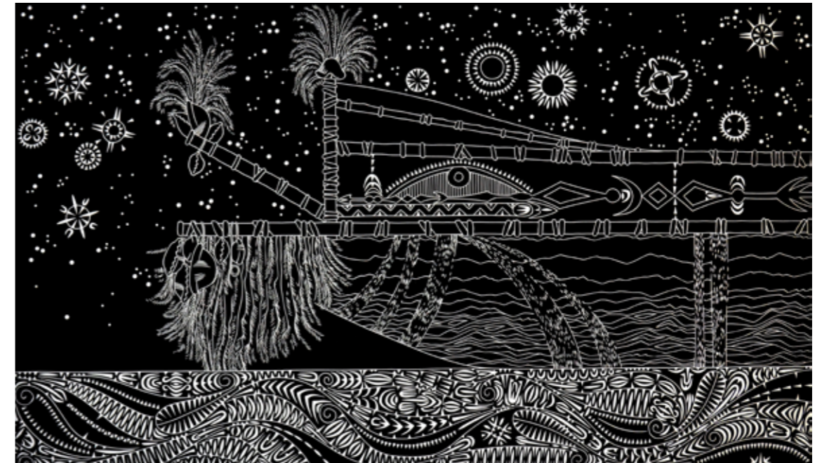
Navigating a treacherous waterway, 2017, Linocut, 70 x 120 cm

Affiliated businesses include Indidjinart, Red Centre Art and Beyond Boomerangs.