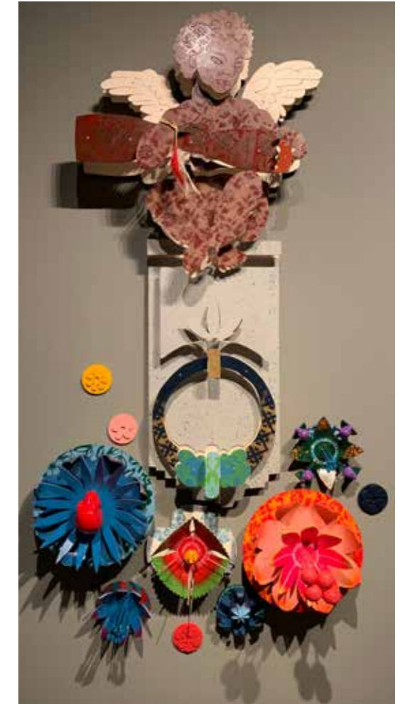
Ari Puilalg, 2016 Mixed media, 180 x 120 x 30 cm The bushell was blown heralding the arrival of the monsoons, 2015 Mixed media, 150 x 115 x 25 cm