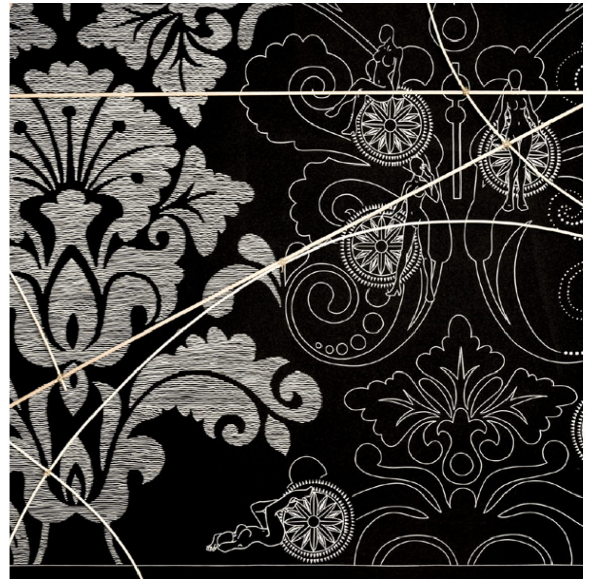
Detail, Usal: The seven sisters that play amongst the stars , 2016, Linocut on paper on board, mixed media, 100 x 194 cm