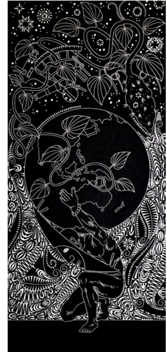
Moving with the rhythm of the stars , 2017, Linocut, 99.5 x 45cm